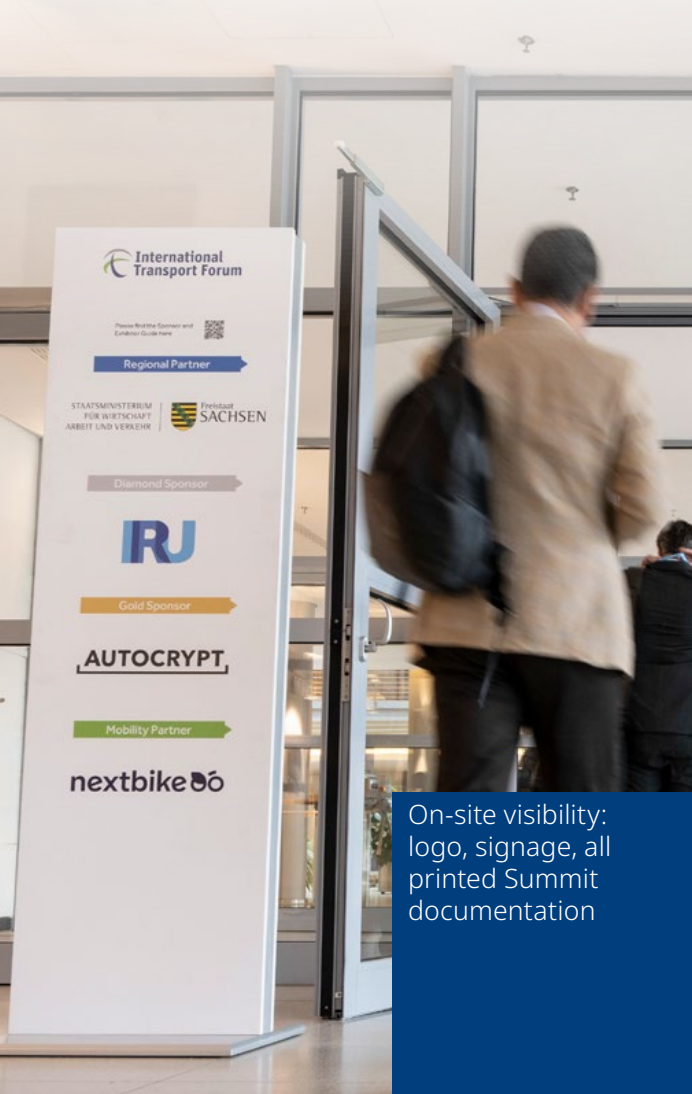
On-site visibility: logo, signage, all printed Summit documentation